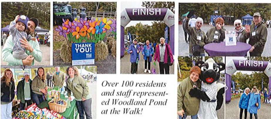
Over 100 residents and staff represented Woodland Pond at the Walk!

~ Scenes From Last Month's Alzheimer's Walk ~ Woodland Pond raised more than $20,000 for the cause!