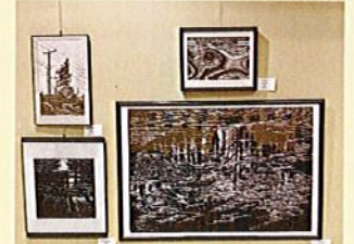
Creativity flourishes at Woodland Pond