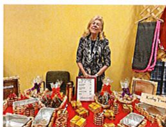
More scenes from our Kaleidoscope of the Arts Craft Show and Sale...