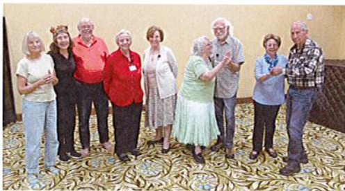
The Movement Music & You class holds still for a group photo. Come join the group on Tuesdays at 11a.m. in the PAC.

Woodland Life Travels to ... Sweden, Florida, Michigan, and back to college!