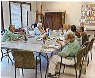
The Watercolor Class, deep in concentration!