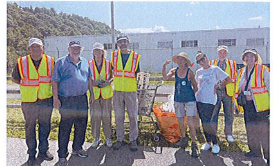
Our intrepid cleanup crew keeping up with our Adopt-a-Highway project on Rte. 299.

Editor's Note: 15 years, 14 resident committees, and more than 40 (current) interest groups later ...what an amazing, vibrant community we've constructed together ~ well worth celebrating!