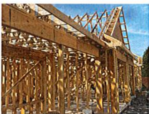
New cottage construction